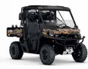
DEFENDER MAX DPS